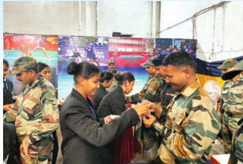
Raksha Bandhan at Deolali Camp 2023