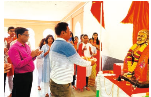
Chatrapati Shivaji Maharaj Jayanti 2023