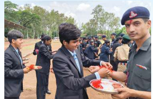
Raksha Bandhan at Deolali Camp 2024