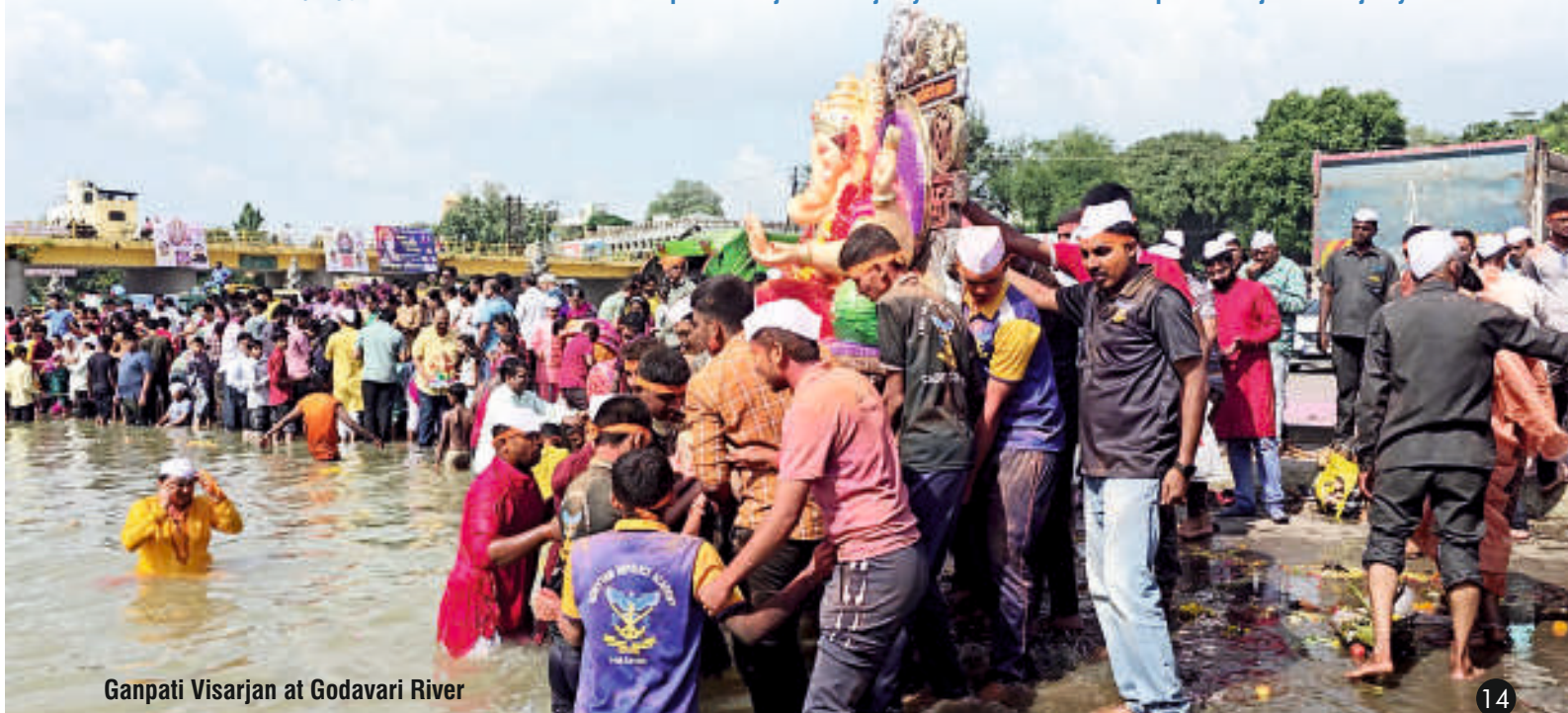
Ganpati Visarjan at Godavari River