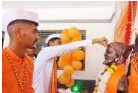
Chatrapati Shivaji Maharaj Jayanti 2024